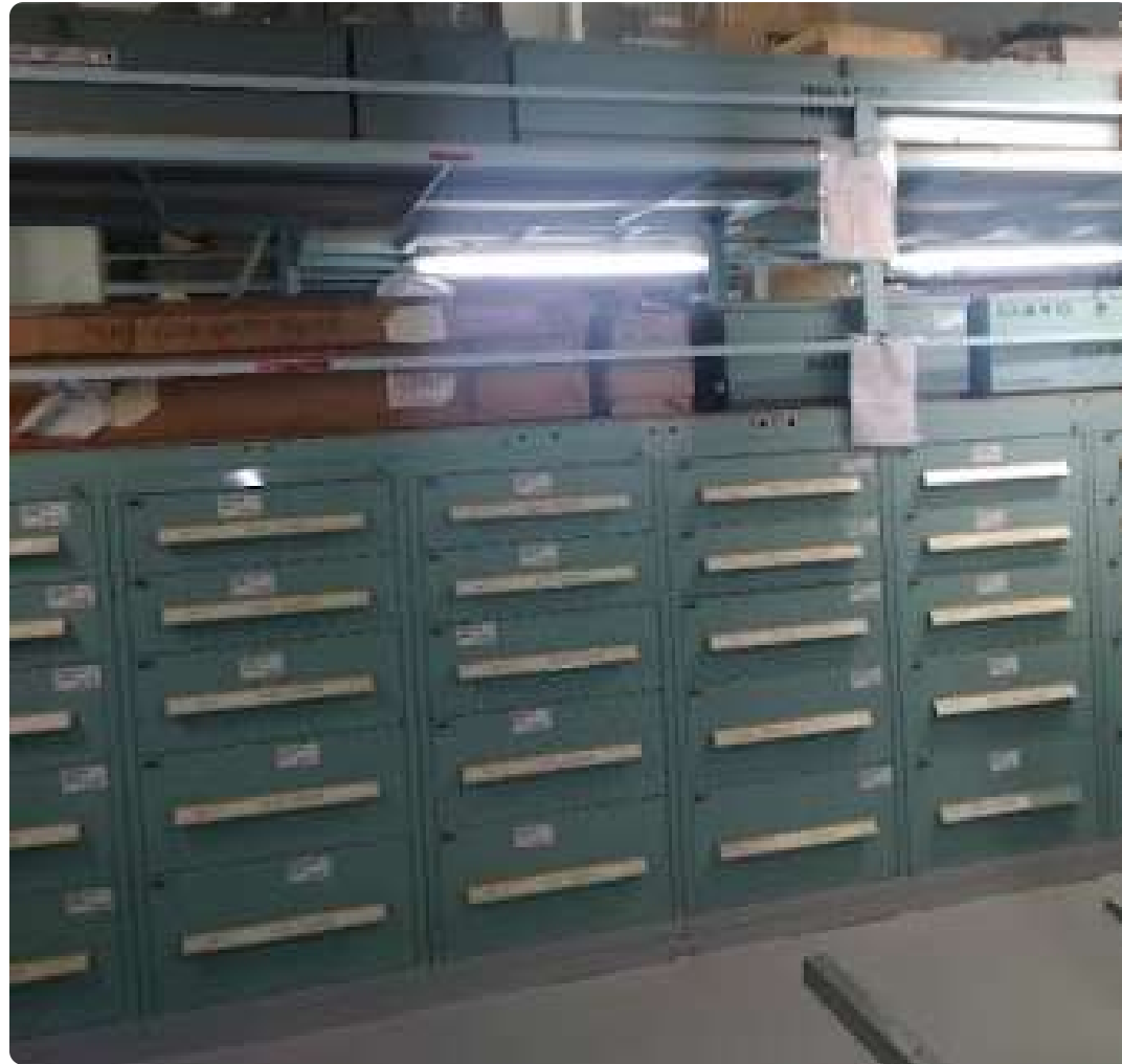
Arranging the spares on shelf