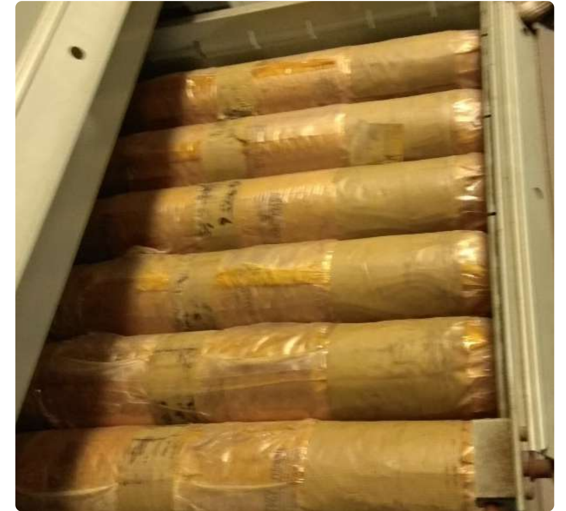
Shafts with protective packing