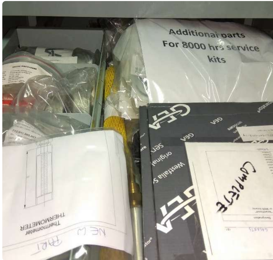
Indexing the spares for easy identification