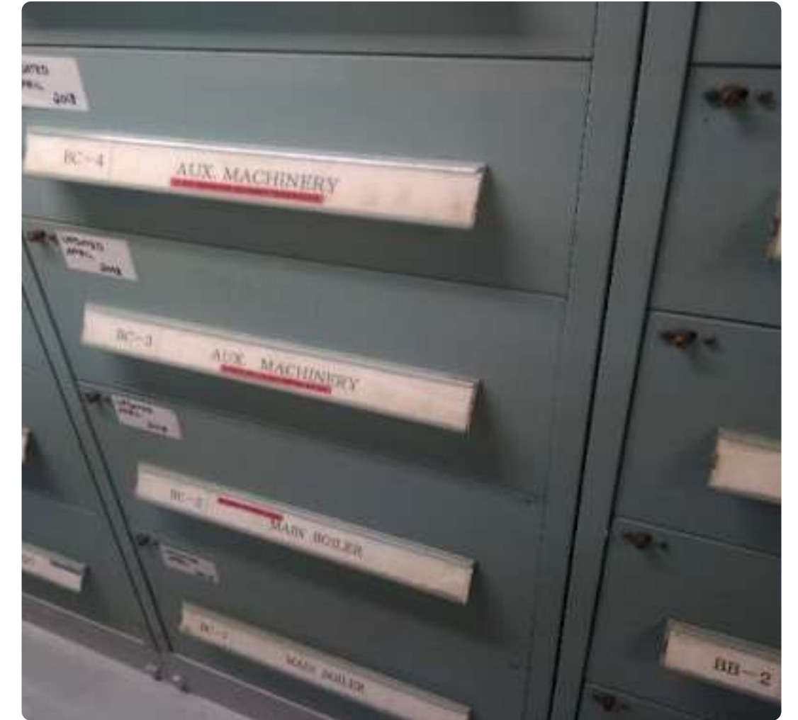
After labelling the shelf