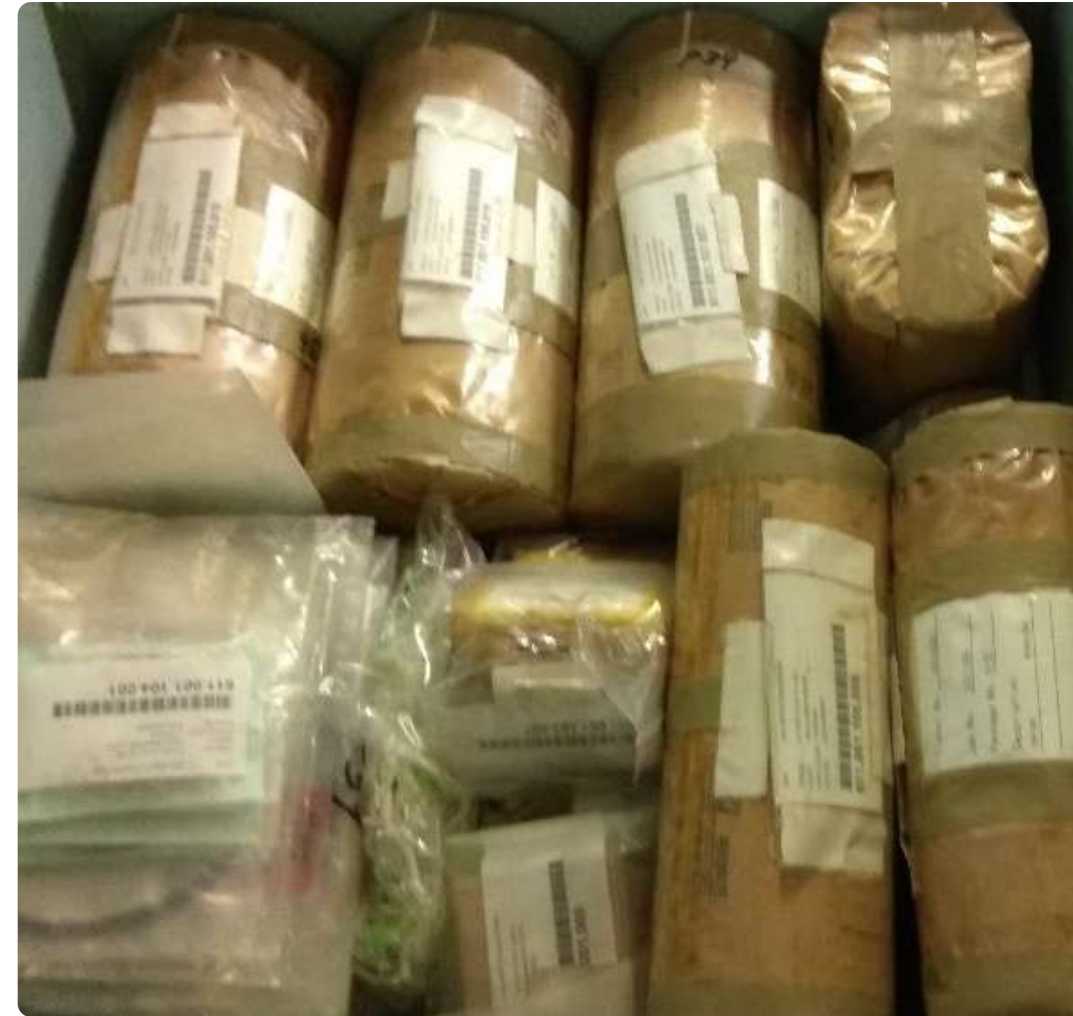
Spares covered with plastic covers along with labels