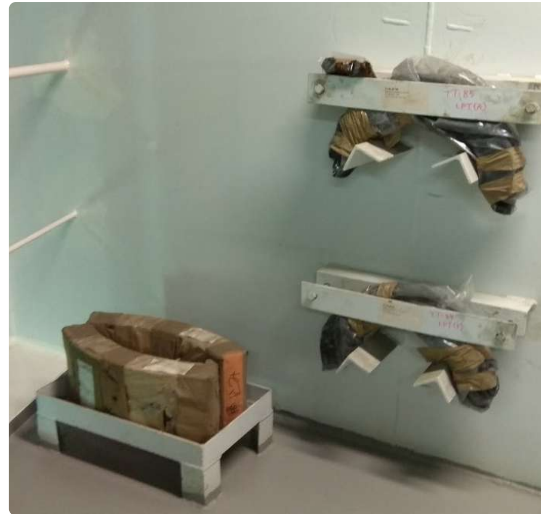
Packing, labelling and placing it on respective place