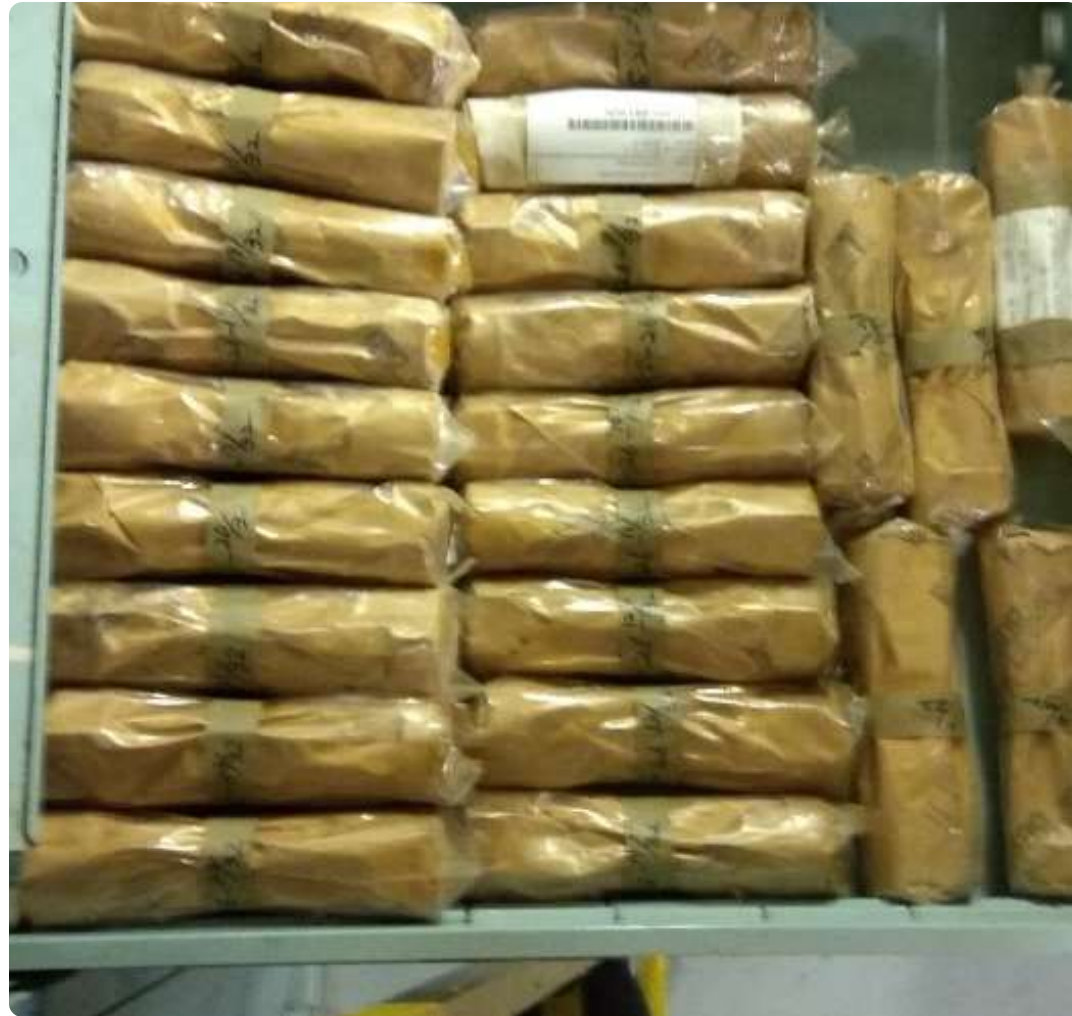
After packing and labelling