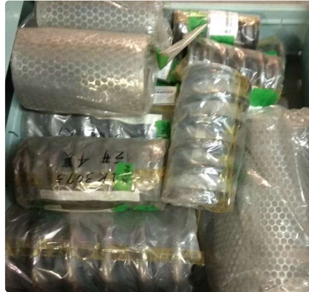
Filters with label and packing